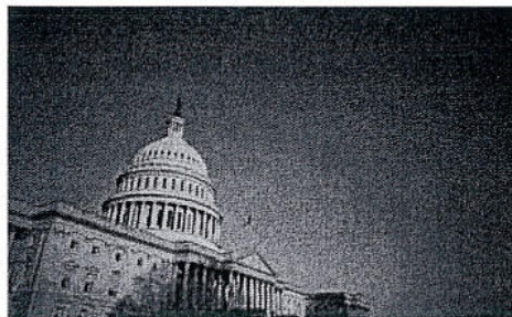
The U.S. Capitol Building is seen at sunrise in Washington, November 17, 2008.

WASHINGTON (Reuters) - An $825 billion economic stimulus package sought by Democrats cleared a key hurdle on Wednesday as a House of Representatives panel approved major portions of the spending initiatives in the plan that President Barack Obama wants enacted by mid-February.